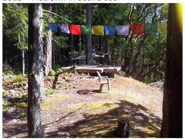
2013 – Platform in active use.