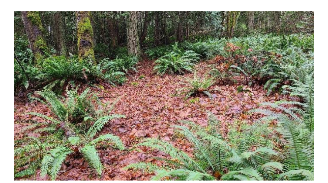
Dec. 2020: Site of former meditation hut.